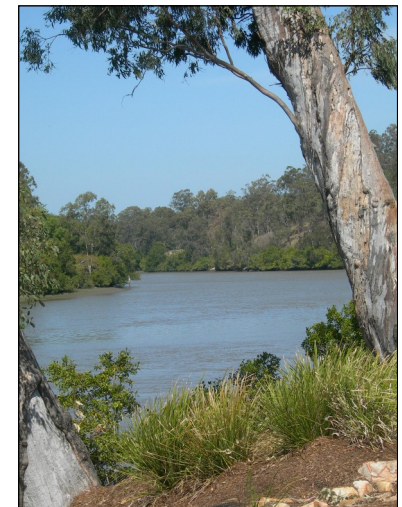
Brisbane River from Rocks Riverside Park