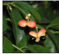
Tulipwood seeds Local native tree