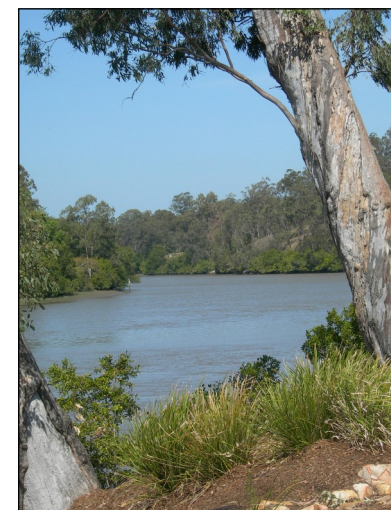
Brisbane River from Rocks Riverside Park