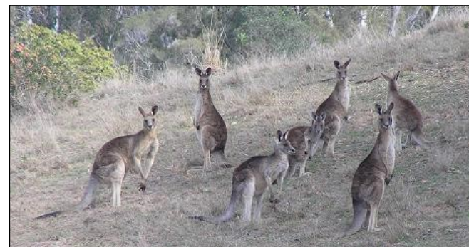
Eastern Grey Kangaroos at Wolston Creek Bushland Reserve