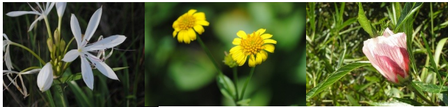
Local native plants