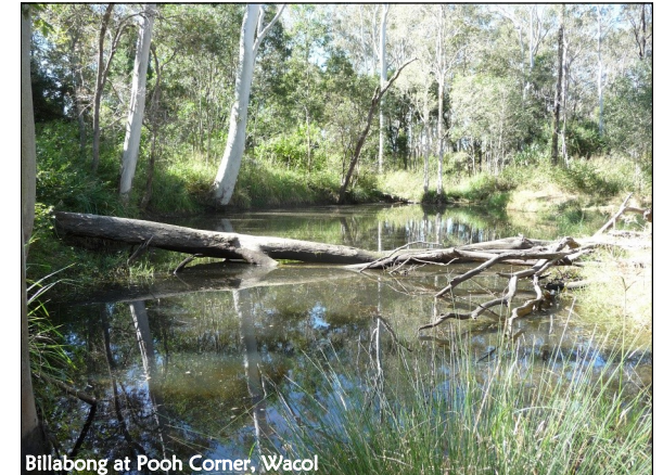
Billabong at Pooh Corner, Wacol

A community environmental group which focuses on protection of the natural environment, public parkland and recreational areas, and reduction of the impact of development in the Centenary suburbs and neighbouring districts.