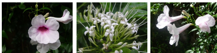
Local native plants

CDEA is negotiating with the state government on the transition of 200 ha of Wacol state land [as seen above] to be used for public open space and recreation