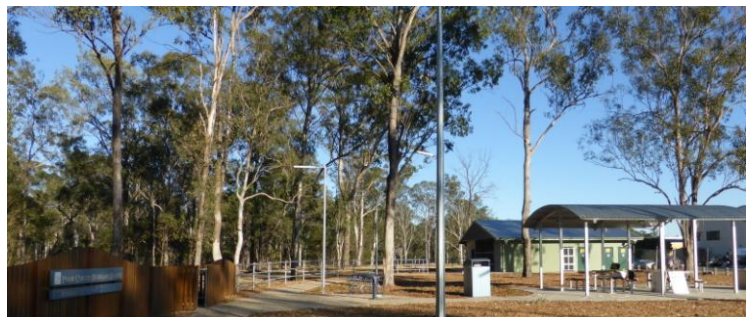
Pooh Corner Environment Centre, Wacol