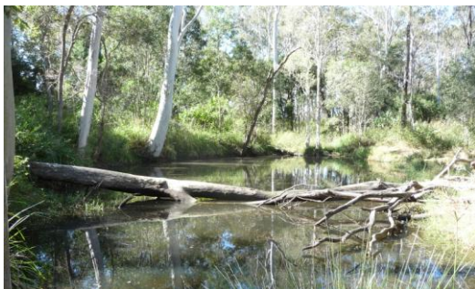
Pooh Corner billabong

Environmental Centre at Pooh Corner, Wacol CDEA liaised with BCC for the first environmental centre in Brisbane's southwest and it is now completed. CDEA has since received a Lord Mayor's Suburban Initiative Fund grant to fit out and furnish the interior. UBD 197 L16