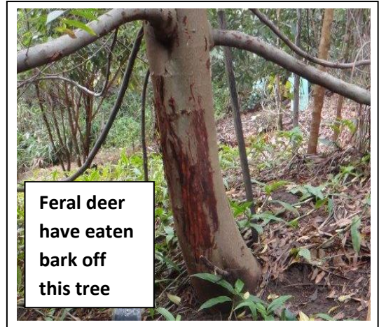
Feral deer have eaten bark off this tree

Attach lengths of wool (preferably heavier ply) at approx 15 cm intervals down the length of both sides of the tree protector so it can be tied around the tree.