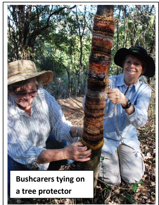
Bushcarers tying on a tree protector